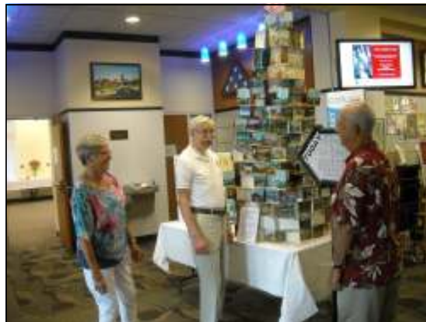
OPDCC House of Cards at Chesterfield Library

Not only did we have lots of community interest and comments, but we also had great press coverage, with articles in the Richmond Times-Dispatch Weekender, the Chester Village News, the Petersburg Progress-Index, and the Chesterfield Observer. Over 200 Club Show cards were taken by the public during the Exhibit, as well as membership applications, and a special commemorative Library Exhibit Postcard (available at the August meeting). We have also received exhibit requests for next year from