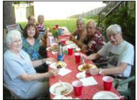
ODPCC members, enjoying June picnic.