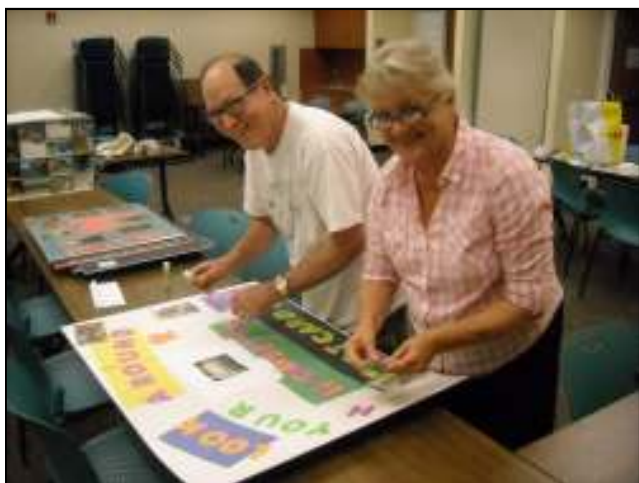
OPDCC members putting things together.

The Women's Club of Chester provided a nice reception for us on July 9, and many members attended. There was a competition to "Guess the number of cards" in the "House of Cards" during the Reception – the winner will be announced at the August meeting. If you couldn't