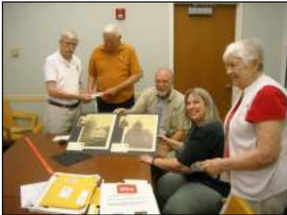
OPDCC members at work on 2016 Chesterfield Library Postcard Exhibit

and take-down of this Library-wide exhibit deserve a big round of applause. Over 15 members supplied display boards and/or postcards for the exhibit. In all, there were over 50 individual displays, as well as a huge wall full of enlarged postcards in the children's area, a special exhibit