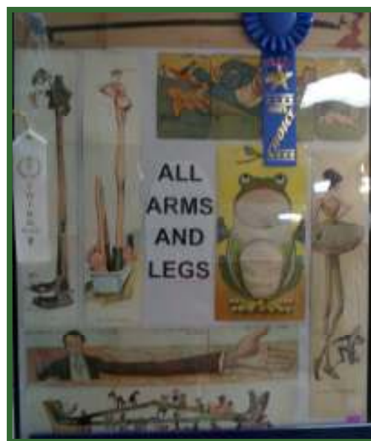
3rd Place Ribbon - Miscellaneous category and Judge's Most Interesting