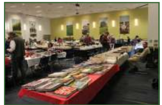
2016 Show Floor - Collectors and Dealers