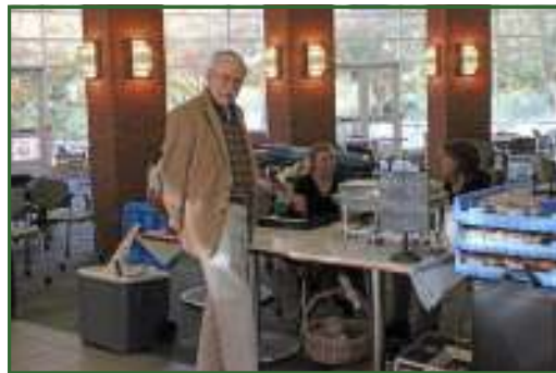
Sibley's Barbeque of Chester offered lunch on both days of the show.