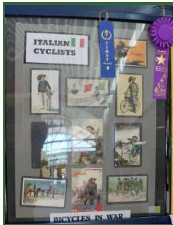
1st Place Ribbon -Topical category and Judge's Best of Show