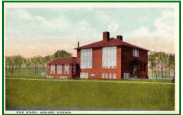
High School, Ashland, VA