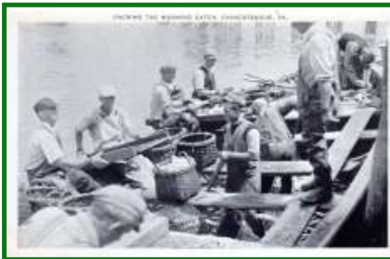
Packing the Morning Catch, Chincoteague, VA